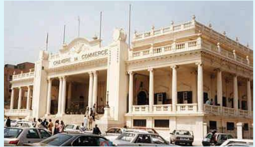
Chamber of Commerce