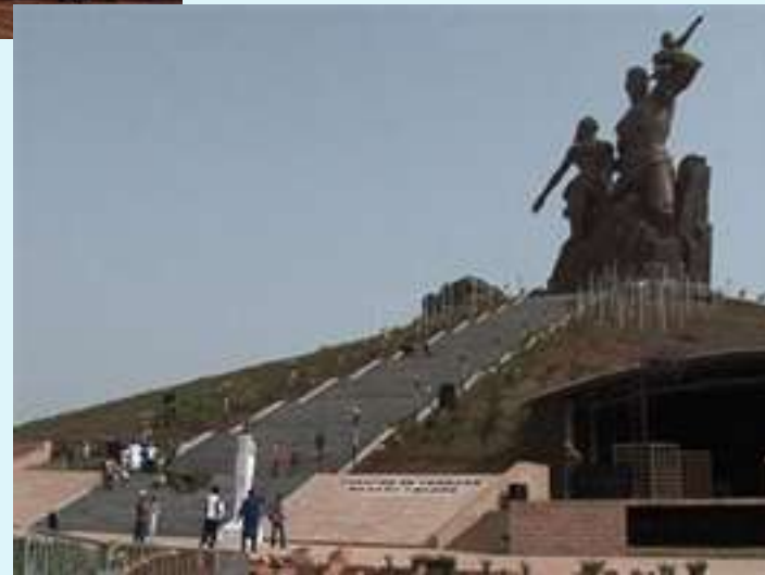
TheAfrican Renaissance Monument