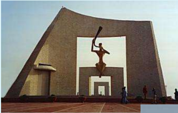
The Millenium Gate