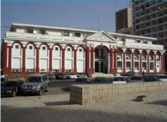
Foreign Office (Independence Square)